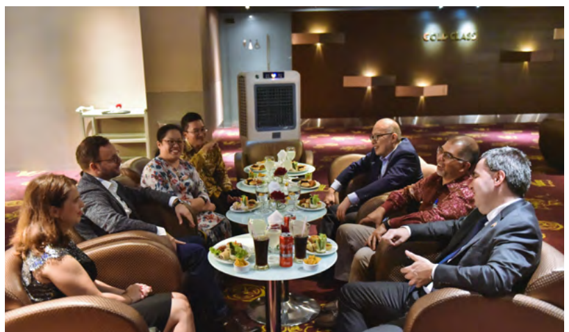
VVIPs of the Hungarian Film Fiesta 2.0 in the Gold Class Lounge during the launch in GSC Pavilion KL

2019 also marks the 50 th anniversary of the diplomatic relations between Hungary and Malaysia, making it a very special year for Malaysians and Hungarians. What better way to celebrate this milestone and making the Hungarian culture more accessible to Malaysians with Hungarian films on the big screen in these regions.