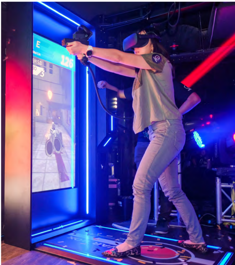
At launch, two interactive shooter games - Over Kill & Double Tap – will be available on the VAR BOXes at GSC. These games will feature leaderboards and online multiplayer capabilities.