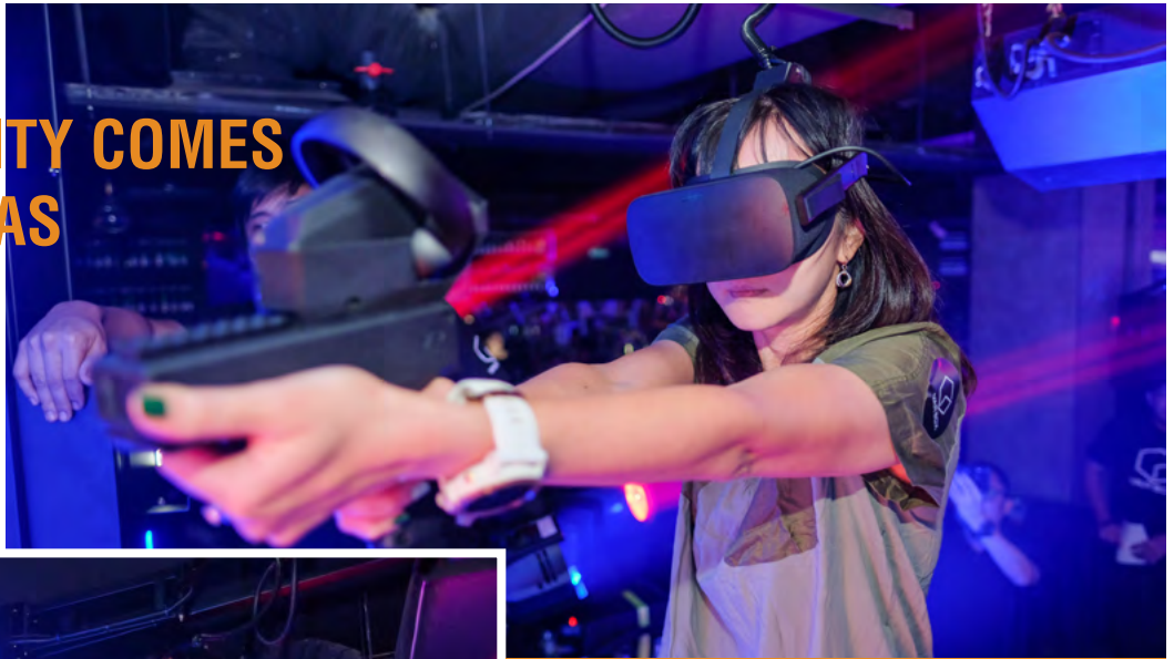
A participant trying out the new VAR BOX, which comes with realistic weighted VR Guns