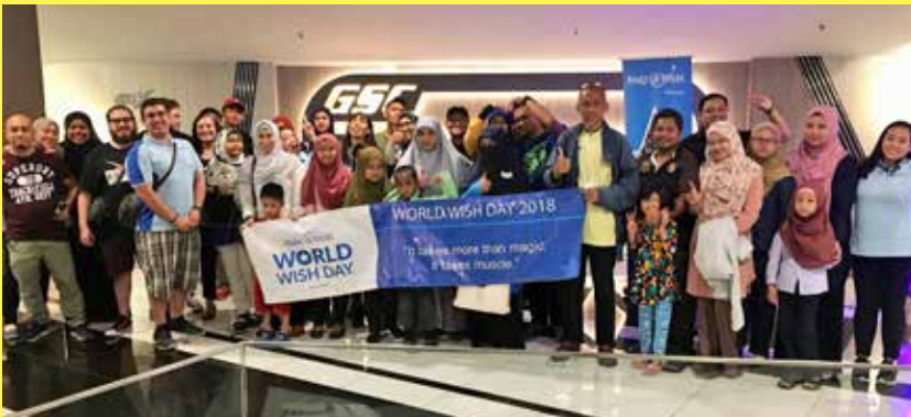
Make-A-Wish AIW Screening - Johor Bahru

In celebration of World Wish Day 2018 on 29 April, Golden Screen Cinemas (GSC) collaborated with Make-A-Wish Malaysia to organise a special movie day out at several locations for 30 Wish children and their families, treating them to a screening of the summer's biggest blockbuster, Avengers: Infinity War. The screenings took place at GSC Ipoh Parade, Ipoh and GSC Sunway Carnival, Seberang Jaya on 5 May, and at GSC East Coast Mall, Kuantan and GSC Paradigm Mall, Johor Bahru on 12 May.