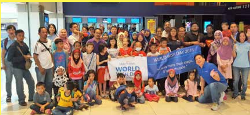
Make-A-Wish AIW Screening - Penang