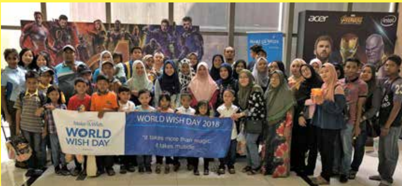
Make-A-Wish AIW Screening - Ipoh