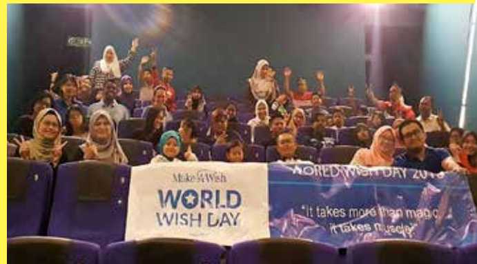
Make-A-Wish AIW Screening - Kuantan