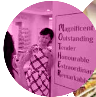
Posing for ..... a picture.