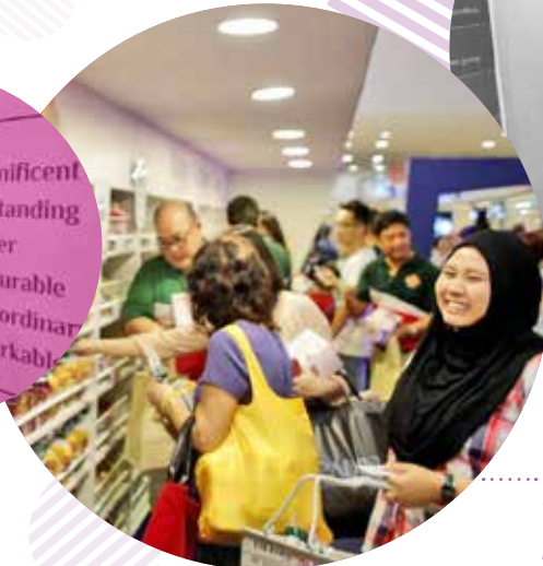
..... Sales booth selling Massimo's products