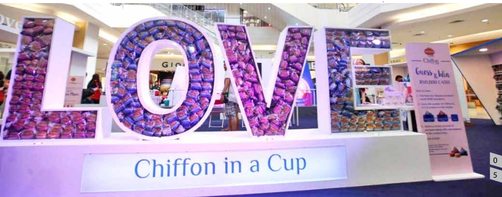
..... Guessing the number of Massimo Chiffon in a Cup in the "LOVE" display under the 'Guess & Win' contest

Adding to the warmth of the occasion, Massimo 'Chiffon in a Cup' also showcased a film for Mother's Day entitled, "Ikatan", a story about a mother's love for her son who realises how sacred it is. The purity of the story resonated with many Malaysians as families were seen sharing a special embrace after the screening. The film is also available on YouTube at https://www.youtube.com/watch?v=JJsD3fgLkN0