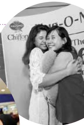
"Hug-O-meter" checked the score ..... of mother and child's best hug.