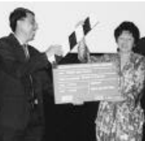
YB Dato' Dr. Ng Yen Yen, claps the famous "clapper board" to launch the event.

Since its inception on 2nd December 1999, over 70 award winning foreign language films have been released under the International Screens banner. Thematic film festivals have also been held at International Screens, some in collaboration with foreign diplomatic missions and agencies.