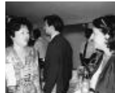
YB Dato' Dr. Ng Yen Yen speaking with guests from the trade commissions

Some of the major events which have taken place at the International Screens are:-