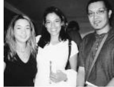
Local celebrities enjoying themselves