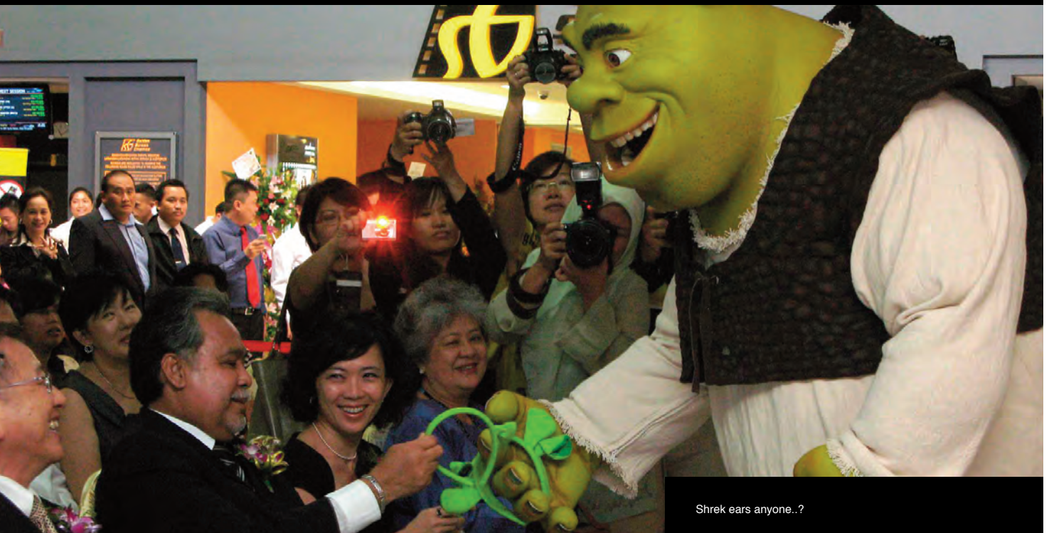
Shrek ears anyone..?