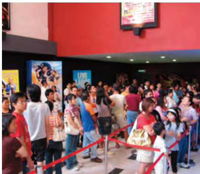
L: Crowd at GSC Suria Sabah R: Signing on the medieval paper

With this new cinema , GSC currently has a total of 183 screens in 23 locations nationwide.