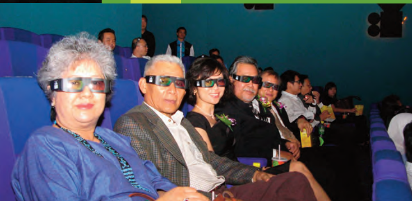
VIPS with their 3D glasses